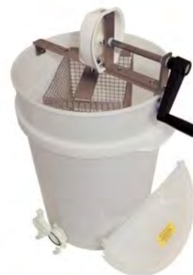
Table top extractor from Thornes (National/WBC)